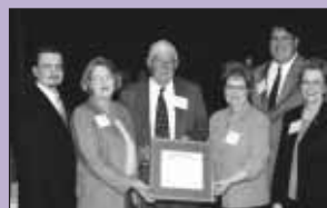
SOSU Receives Charter